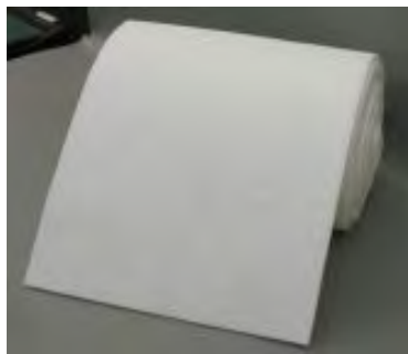
DFM 8 Media