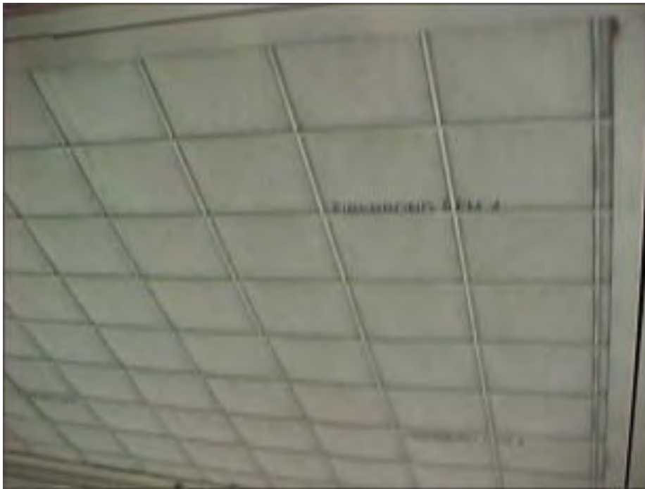
DFM 4 media utilized as a ceiling filter in a downdraft paint booth.