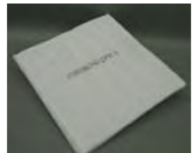
DFM Panel Filters

Diffusion media test report is available on the Fiber Bond finishing products catalog CD or by contacting the marketing department at (219) 879-4541.