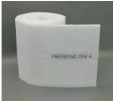
DFM 4 Media